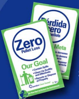
6" x 18" Railcar Stickers