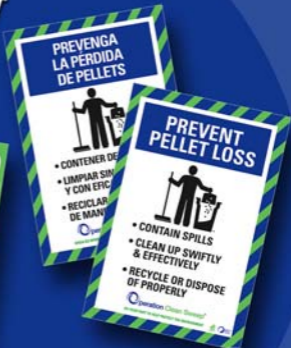
2' x 3' Posters